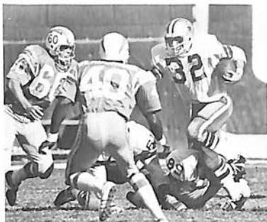
Chargers close in on Garrison in 1972.