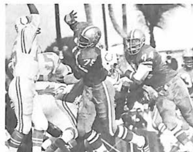
Morrall, Pugh and Lilly in Super Bowl V.