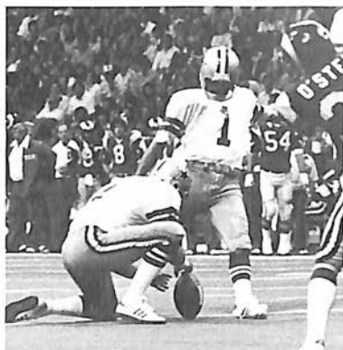
Septien hits field goal against Rams in 1979.