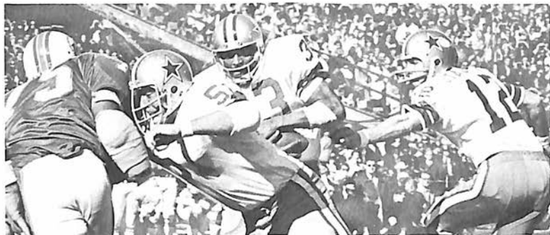
Roger Staubach hands off to Duane Thomas in Super Bowl VI.