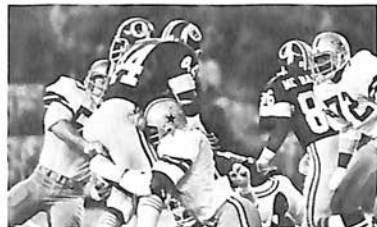
Dallas stops Washington's John Riggins in 1978 Monday nighter.